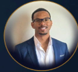
Min. Detraï Edwards, Minister of Music

October is Breast Cancer Awareness Month, which is an annual campaign to increase awareness of the disease.